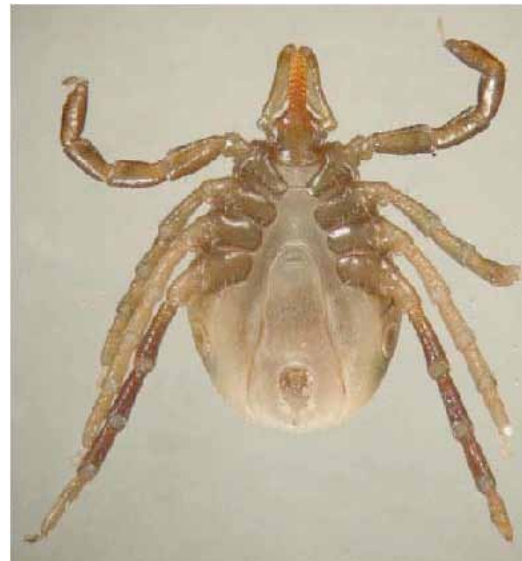
Underside of a female paralysis tick.

Male paralysis ticks may occasionally clamber onto people, but unlike females, they almost never feed on humans or other vertebrate hosts. However, like little vampires, they steal blood from their engorged female counterparts. This unusual choice of host is reflected in their mouthparts which are short and poorly developed in males. Engorged female ticks often bear feeding scars from males piercing their body wall. One female was recorded with 15 such scars!