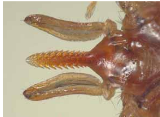
Paralysis tick mouthparts showing hypostome flanked by the sensory palps.

If an appropriate pyrethroid or similar preparation is not available then the tick will need to be pulled out. To pull ticks out, grip the 'head' region with fine tweezers and pull firmly and steadily. It is difficult to pull out Australian Paralysis Ticks without breaking their long mouthparts. However, if mouthparts detach they are simply dead; they cannot produce toxin or continue to burrow. Because mouthparts tend to be deeply embedded in an inflamed wound they may take several days to slough out; treat the bite site with antiseptic.