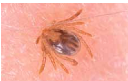
Paralysis tick feeding. The hypostome is fully inserted in the wound that it has cut and the palps are splayed across the skin.

Adult paralysis ticks mostly appear from September to midsummer. Adult females (4 mm) can be distinguished from other commonly-encountered tick species by their exceptionally long mouthparts (ca.1mm long), the absence of any coloured markings on the dorsal shield, and by the first and last legs being darker than other legs. Body colour is affected by feeding and is not reliable for tick identification.