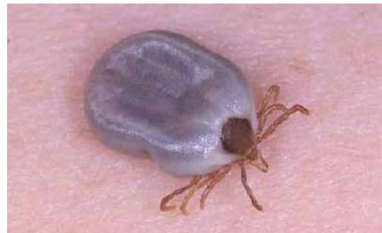
Semi-engorged female paralysis tick. Only the sac-like body has increased in size – the hard shield remains the same size throughout feeding. Image: QM.