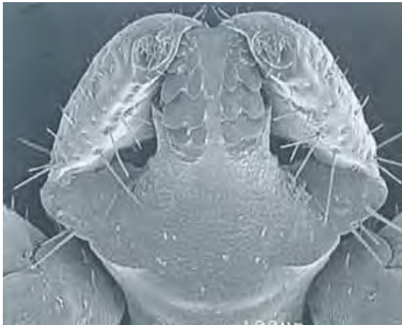
The short mouthparts of a male paralysis tick.